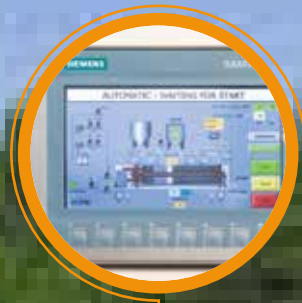
ALLEN BRADLEY AND SIEMENS TECHNOLOGY FOR PLC