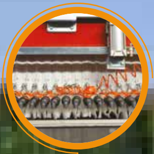
AUTOMATIC REAL WASHING