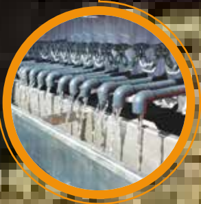
OPEN FILTRATE DESIGN