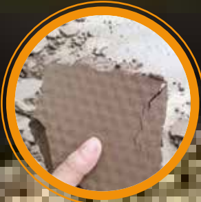
MOISTURE < 20%